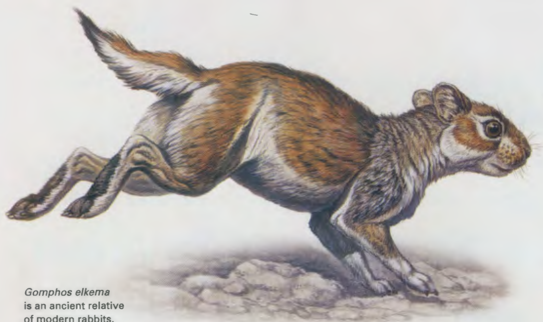
Gomphos elkema is an ancient relative of modern rabbits.

Early Hopper What jumped like a rabbit but chewed like a squirrel? Gomphos elkema , a 55-million-year-old relative of the rabbit, a fossil of which was found in the Nemegt basin, Mongolia. The discovery supports the long-held theory that rodents and lagomorphs—the group that includes rabbits, pikas, and hares—shared a common ancestor that lived around the time dinosaurs became extinct.