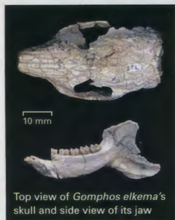
Top view of Gomphos elkema 's skull and side view of its jaw

The extinct animal's cheek teeth (left, at bottom), however, were quite different from rabbits', says Robert Asher, curator of mammals at the